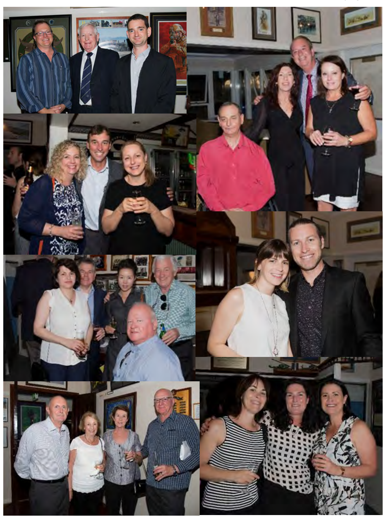
Chairman's Function ...continued from page 19