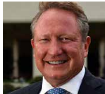
Andrew Forrest, AO