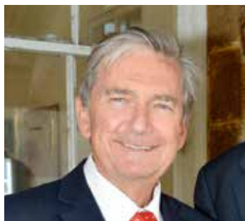
Hon Chris Ellison Committee Chairman