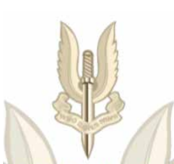
Commanding Officer SAS Regiment

Patron: Major General the Honourable Michael Jeffery, AC, AO(Mil), CVO, MC (Retd)